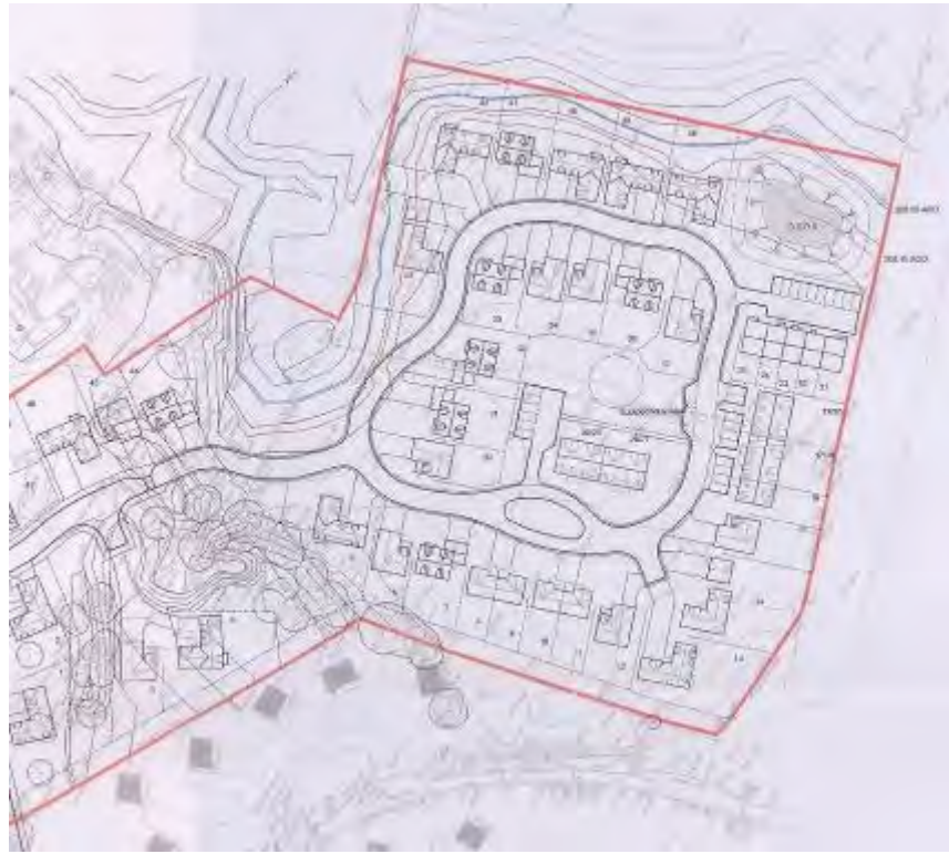
Fig. 4 : proposed south eastern corner of Site I

car parking provision. Communal car parking areas are identified adjacent to the terraced and flatted properties. In addition to the equipped play space, the south eastern area of the site also includes another large area of open space, positioned between properties 4 and 5, and extending to approximately 1,600 square metres.