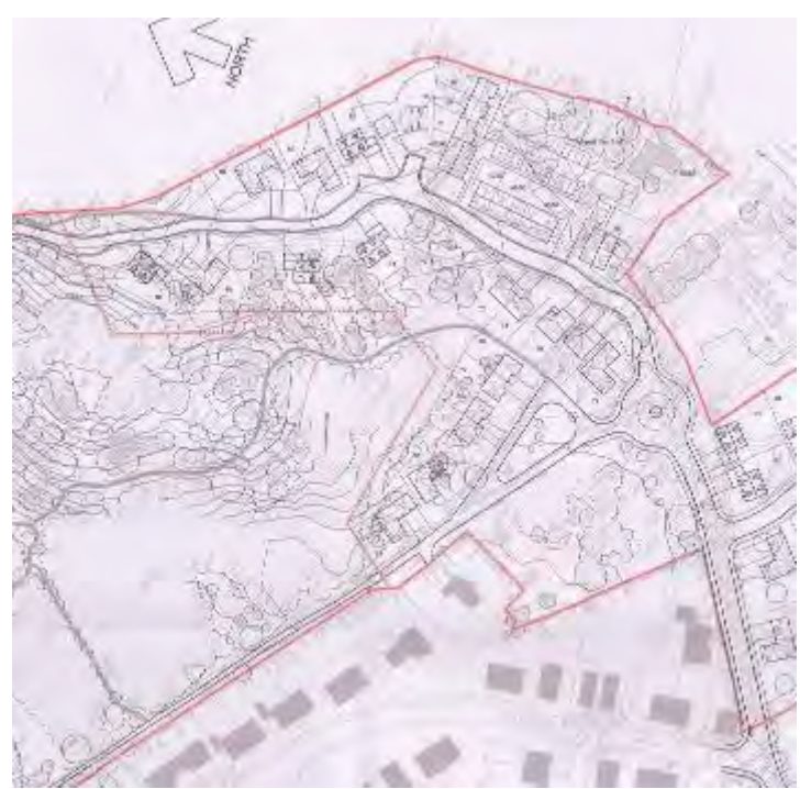
Fig. 6 : northern area of site

leads to the west, in the direction of the existing track past Heather Cottage and towards Spey Avenue, and to the north towards the boundary of the site with the adjacent golf course. Earlier indicative site layout plans submitted showed the majority of the areas on either side of the western road being proposed for housing. However, in response to concerns raised about the negative impact that development would have on the natural heritage value of the area to the front of Heather Cottage, the layout was significantly revised. The current indicative proposal includes the retention of this area in its natural state and the curtailment of housing to the northern side of the road, close to the edge of the site boundary and the birch woodland area. Six dwelling units are proposed in this area, of which there is a mix of semi detached and detached, with the houses oriented southwards, to overlook a proposed triangular area of 'amenity shrub planting.'