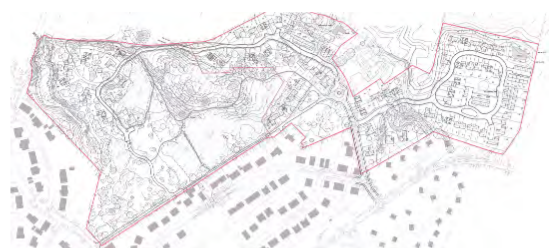
Fig. 3 : Proposed site layout plans (the broken red line identifies the boundary division between site 1 (right) and site 2 (left))

I. This report covers two related planning applications for outline planning permission for residential developments on adjacent areas of land in Dalfaber, in the northern area of the settlement of Aviemore. The applications encompass a combined area of approximately 10.8 hectares. The larger of the applications (CNPA planning ref. no. 07/145/CP) is for the development of 88 dwelling units, while the smaller application (CNPA planning ref. no. 07/144/CP) is for the development of 11 serviced house plots. For ease of reference and generally working from south to north across the area, the report will refer to the larger housing proposal as Site I and the application for the II serviced house plots as Site 2. The overall area of land is bounded to the north west, west and south west by existing residential developments in the Dalfaber area - Dalfaber Park to the north west consists of relatively recently constructed detached properties of varying designs built on individual plots, whilst Spey Avenue to the west, together with Callart Road / Corrour Road to the south west generally comprise of a slightly higher density of development, predominantly in the form of semi detached properties and 'four-plex' units.