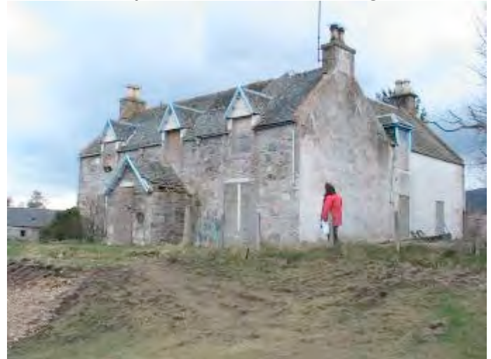
Fig. 9 : Dalfaber Farmhouse

plain. I consider the indicative layout to be generally acceptable. While I would expect that any subsequent application that might come forward seeking approval of reserved matters would include a similar layout, it is also necessary to acknowledge that some variations would be inevitable at that stage in order to address any conditions set down in an outline planning permission, as well as dealing with specific plot configuration and design issues which would only arise at that detailed stage.