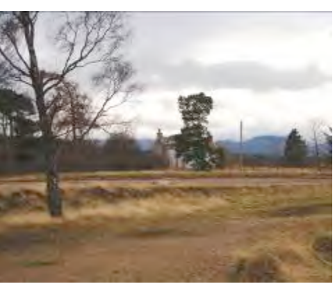
Fig. 8 : Farmhouse and proposed court yard area