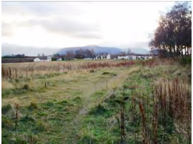
Fig. 5 : View over the open grassland area in which housing is proposed

6. The next area of Site I lies to the north west of the proposed access road, between the edge of the woodland and the ground surrounding the golf course steading. As the main access road traverses further into the site, the road layout incorporates the previously mentioned roundabout, off which a secondary road