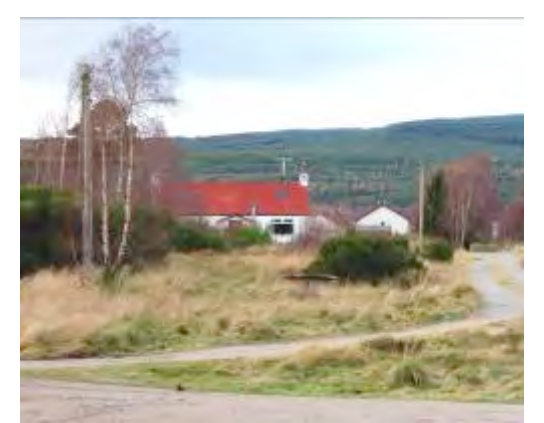
Fig. 7 : Heather Cottage

two blocks of terraced structures. A courtyard area would be formed by the presence of the buildings on three sides, with the fourth (northern) side being open, offering views over the golf course towards the River Spey and the mountains beyond. Communal car parking is arranged in small groups within the courtyard. An equipped play space is also proposed in the area of open space between the car parking and the site boundary. Finally, in the most northerly area of the site, a lower density arrangement of eight detached houses is proposed, with properties positioned either side of the access road. The rear boundaries of the plots on the eastern side abut the golf course boundary, while those to the west of the proposed access road are positioned on the periphery of the birch woodland.