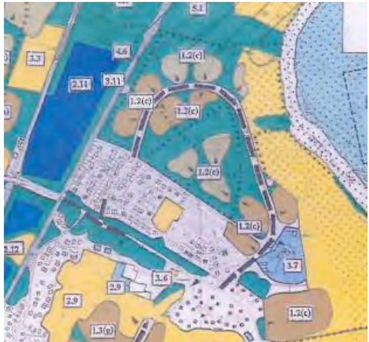
Fig. 8 : Extract from the Aviemore settlement map, Badenoch and Strathspey Local Plan (1997)

Both of the proposed sites are included within the settlement area of Aviemore as detailed in the Badenoch and Strathspey Local Plan 1997 . A number of zones are allocated for housing purposes, with distinctions being made between 'new development' and 'long term' housing development. The majority of zones, which are located towards the centre and south eastern area of the collective site areas, are surrounded by land allocated as amenity woodland. The amenity woodland zoning encompasses large tracts of the western and north western areas of the subject site. In addition a portion of land in the south east of Site I, to the rear of existing Dalfaber Golf and Country Club chalets is allocated for amenity woodland purposes, while a larger area surrounding the steading (which is located outside the site boundaries) and also including some of the proposed site area (including Dalfaber Farmhouse) is allocated for commerce / tourism purposes.